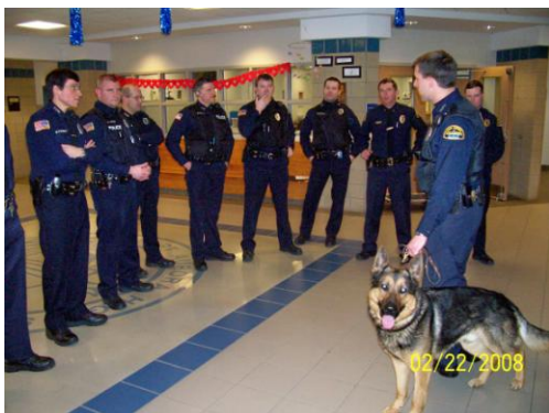
In Service Dept. Training